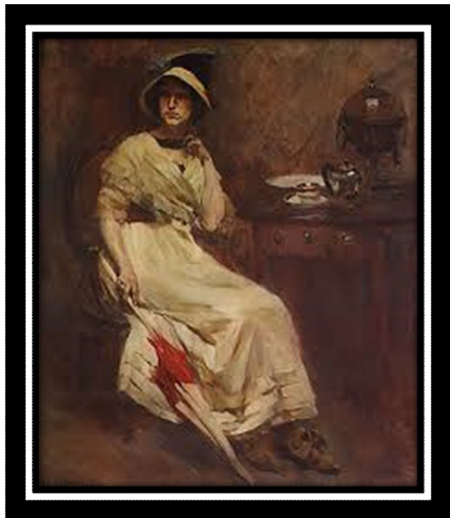
" My mother"