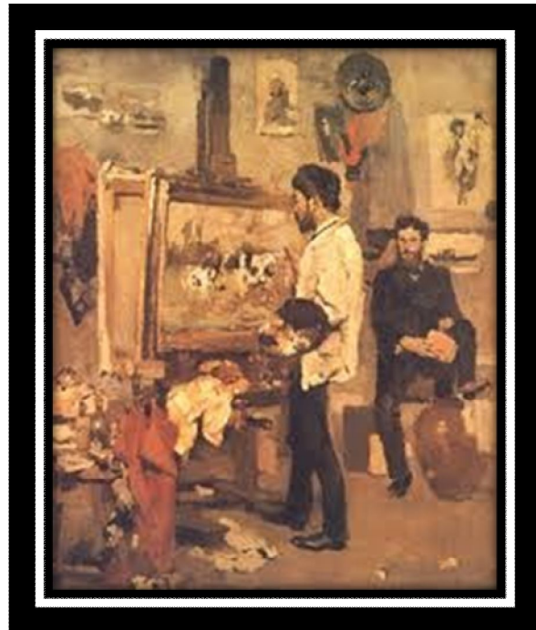
In my studio"

We pressed the pictures of the selected painting, from the internet.