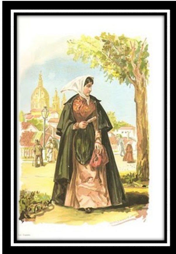
“ Walking on the park”