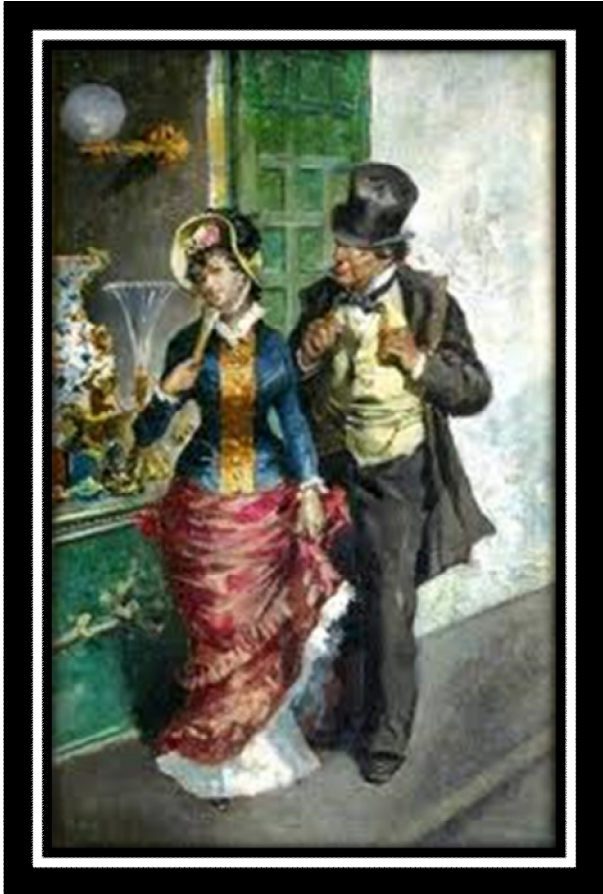
"Going down the Chiado"