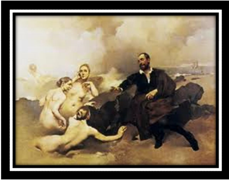
" Camões and the Nymphes"