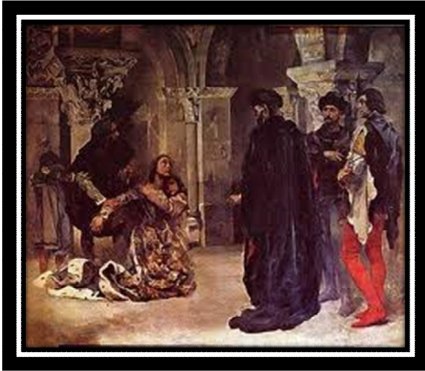
"Lady Inês' death"