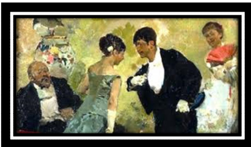
"Invitation to dance"

After that, we have selected the paintings that we are going to work about.