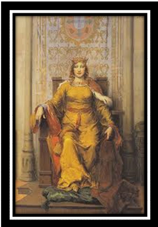
" The Republic"