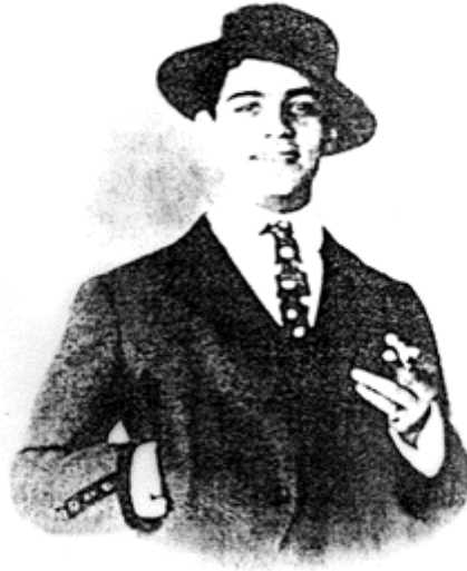
amadeo de souza cardoso

We have observed some Amadeu de Souza Cardoso's Works of Art and we have learnt new things about him.