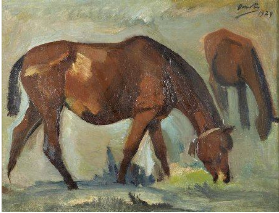
Pintores – painters