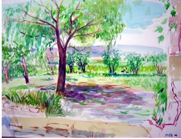
Tinta a óleo – oil